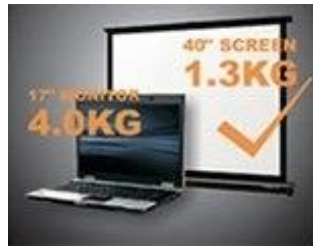
Worlds Lightest Portable Screen 40" diagonal screen that weighs only 1.3Kg