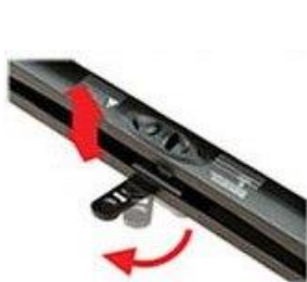
1. Swing out the support foot and the screen surface is released