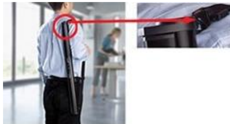
More Convenient Carrying Optional sling makes it easy to carry