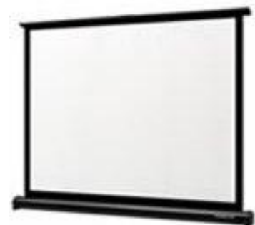
3. Setup is finished