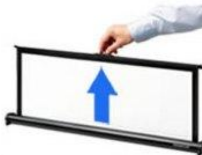
2. Realise the screen surface