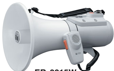
ER-2215W 23W max. with Whistle