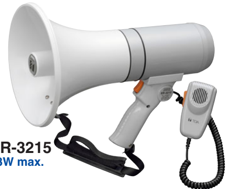
ER-3215 23W max.